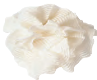
Ramie Luxury Scrunchie Ramie is one of the oldest fibre crops, having been used for at least six thousand years. Gentle on skin. Ensure to leave to dry between washes to prolong use. Code: ACNRSC £3.50