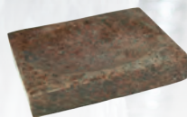
Deep Soapstone Dish Beautifully crafted natural deep soapstone soap dish is the perfect bathroom accessory. Due to the natural origins of the soapstone colours may vary from image shown. Dimensions: 10 x 8.5 x 2cm Code: ACDSSD £4.95