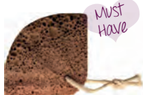
Volcanic Lava Foot Stone A naturally made foot stone to safely assists in the ex-foliation of dry, dead skin from the feet, never losing its effectiveness or shape. You'll only ever need to buy one! Code: ACVLF5 £3.00