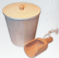
Mini Wooden Bucket & Scoop Set for Bath Salts Made from sustainably sourced hemu wood these cute little sets are the perfect little extra to accompany bath salts. Dimensions : H 95mm x W 90mm Code: ACMWBSS £4.95

A range of natural accessories for your bathroom to buff, polish and exfoliate your skin until you're super soft, relaxed and feeling wonderful.