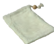
Bamboo Soap Bag Natural ultra soft soap bag, made from Bamboo Yarn to gently massage the skin. Great for using with a solid soap or shower gel. Dimensions: 14.5 x 9.5cm Code: ACBSB £2.50