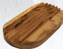
Olive Wood Soap Dish Hand carved in Tunisia as a natural bi-product from the Olive industry. Every hand carved piece is extraordinarily unique, with no two dishes the same. With grooves for drainage. Code: ACOWOSD £7.95